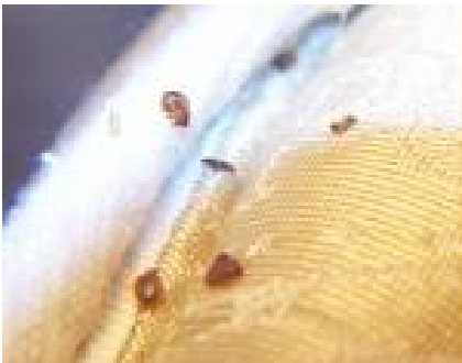
Bed bugs at the seam of a mattress