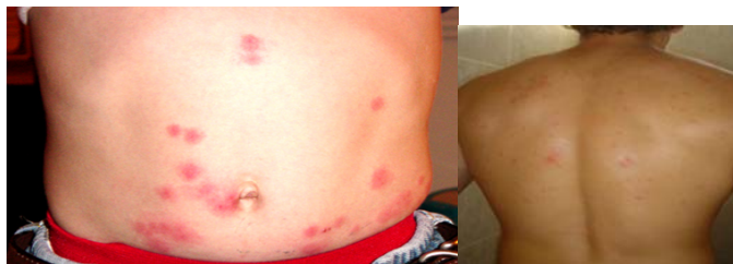
Bed bug bite marks to the back and abdomen