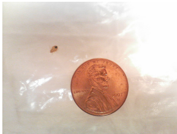
Bed bug compared to a penny for size-relation

Bed bugs can hide in any number of locations – Including some relatively surprising locations. They are usually found in highest concentration in, on and around the bed. Focus inspections, but don't overlook anything: Bed bugs can be found anywhere and everywhere. Generally, bed bugs tend to seek out dark and hidden places like cracks, crevices and holes, and they tend to prefer textured surfaces like wood, fabric, and paper over smooth surfaces like metal, glass and plastic.