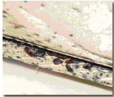
Bed bugs in a mattress seam