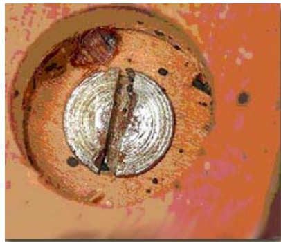
Bed bug in wooden furniture (above the head of the screw)